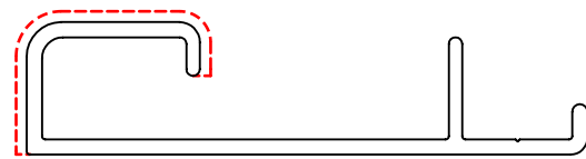
EXTRUSION PROFILE SCALE 1:1